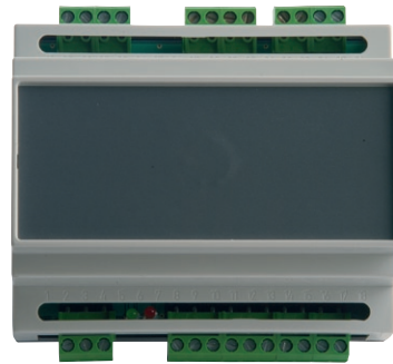
T-RS485 (with cover)

Maximum of 16no T-RS485 controllers on a TVTEL 2K network CAT5E shielded bus.