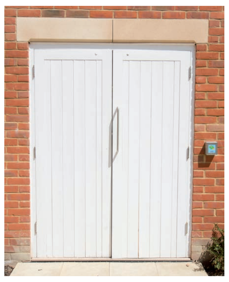
Proximity access controlled rear entrance, bin and bike store for residents only.