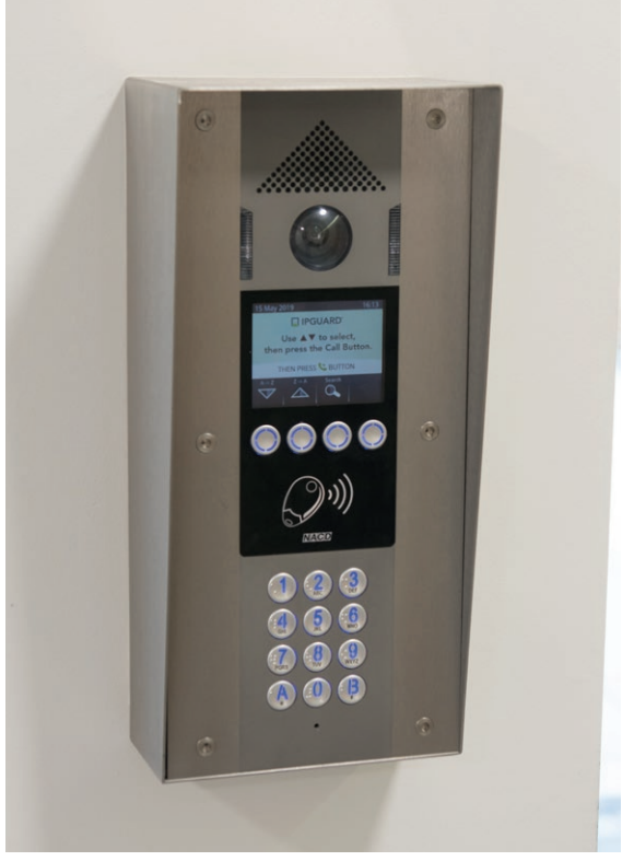
Over 70no IPGUARD® panels!