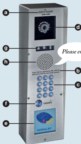
TVTEL ® 240