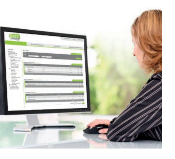
No software required

A resident cannot open the door to a visitor, or by using their proximity key, without it being date and time logged!