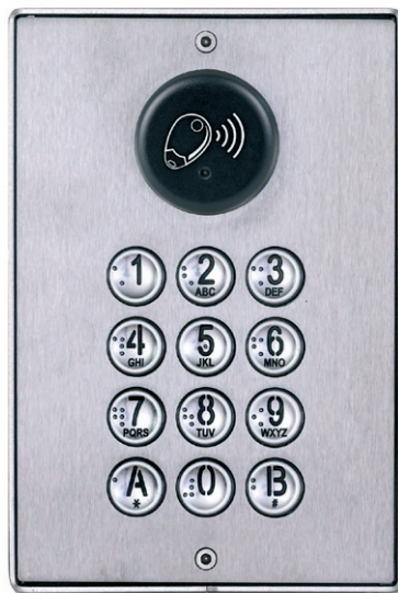
LPTRS (T25 format) Mifare Proximity Reader + DDA compliant braille illuminated keypad + 1SL housing.