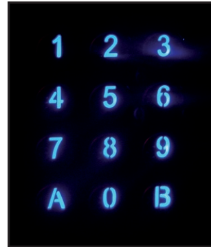
KEYPAD IS ILLUMINATED