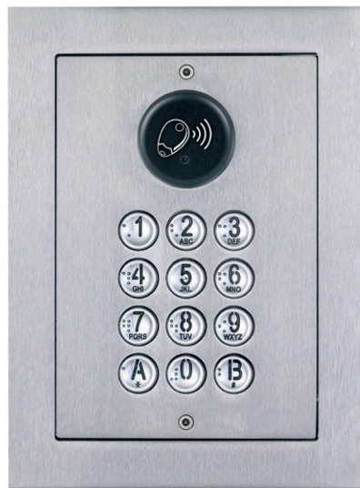
LPTRS (T25 format) Mifare Proximity Reader + DDA compliant braille illuminated keypad + 1FL housing.