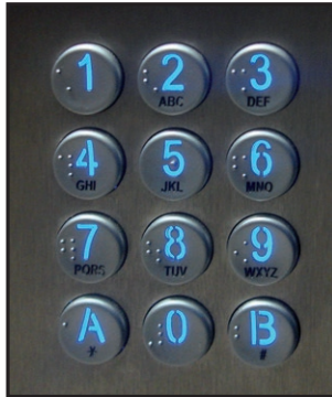
KEYPAD HAS BRAILLE BUTTONS