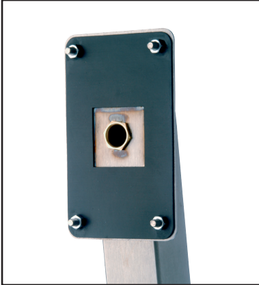
Fixing plate for HS housing