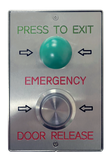
EM24EX + 1SL

Flange: 195mmH x 145mmW Backbox: 168mmH x 120mmW x 80mmD