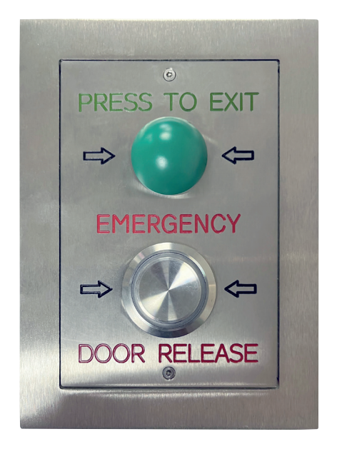
EM24EX + 1FL

Flange: 195mmH x 145mmW Backbox: 168mmH x 120mmW x 80mmD