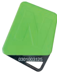
KCP4V PROXIMITY KEYFOB

Our proximity readers operate in conjunction with